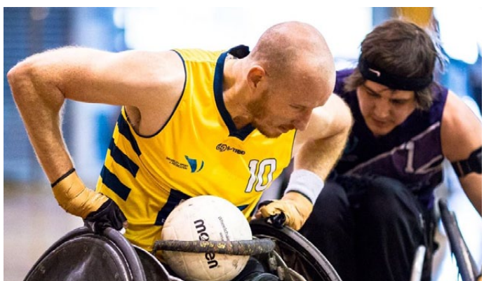
Wheelchair Rugby https://www.together.vic.gov.au/sport/show-usyou-can-play-wheelchair-rugby

Through watching, sharing, and engaging with this series, we hope you will not only consider how your community can get involved, but help others who may benefit from a greater awareness of how our entire community can become more active.