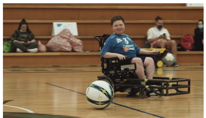
Powerchair Sports https://www.together.vic.gov.au/sport/show-usyou-can-play-powerchair-sports