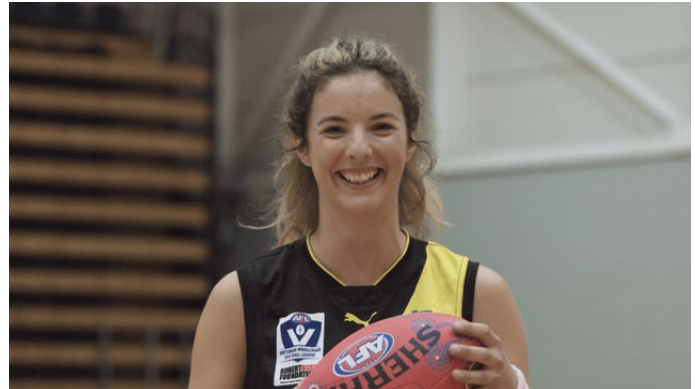
AFL Wheelchair https://www.together.vic.gov.au/sport/show-usyou-can-play-afl-wheelchair

Each episode shows us just how important education, inclusive attitudes and mindset can be, driving home the idea, 'You Can't Be What You Can't See' which is a key theme for the whole series. You can view each episode at: