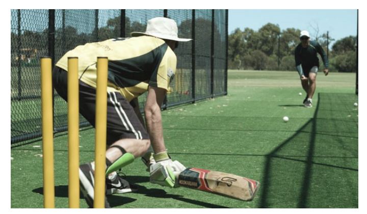
Blind Cricket https://www.together.vic.gov.au/sport/show-usyou-can-play-blind-sports-victoria